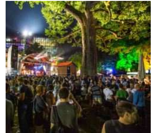
Music in the Park