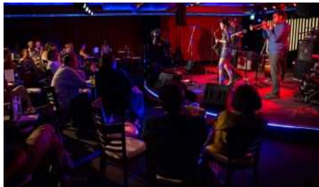
Montreux Jazz Club