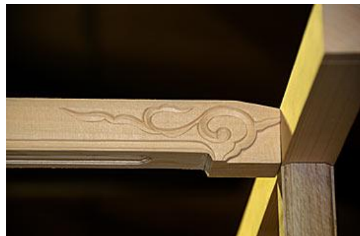
Wood work without nail →