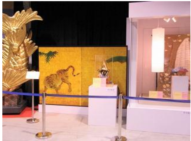
Other things on display